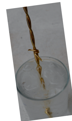
Now it's time for a drink